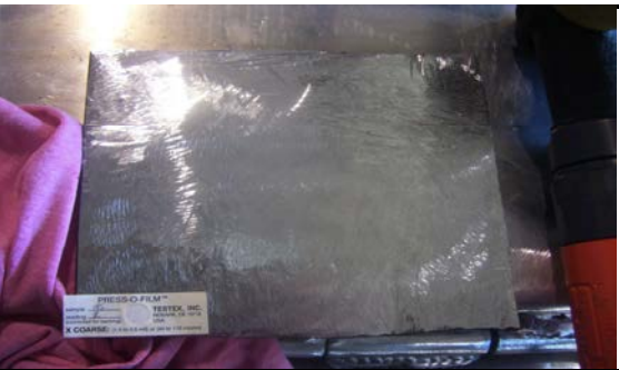
005 Test plate 1 profile 2 mils, right angle grinder