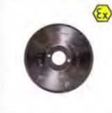
A-0502 – Cutting disc