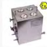
A-0310 Water Control Box