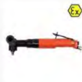
A-0105 Fuji Angle Grinder (FCD-10X-52) (2 PCS)