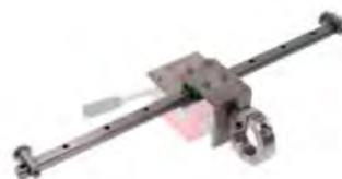
A-0420 (Cutting Guide Compact Without magnet )