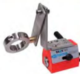
A-0410 Pendulum arm