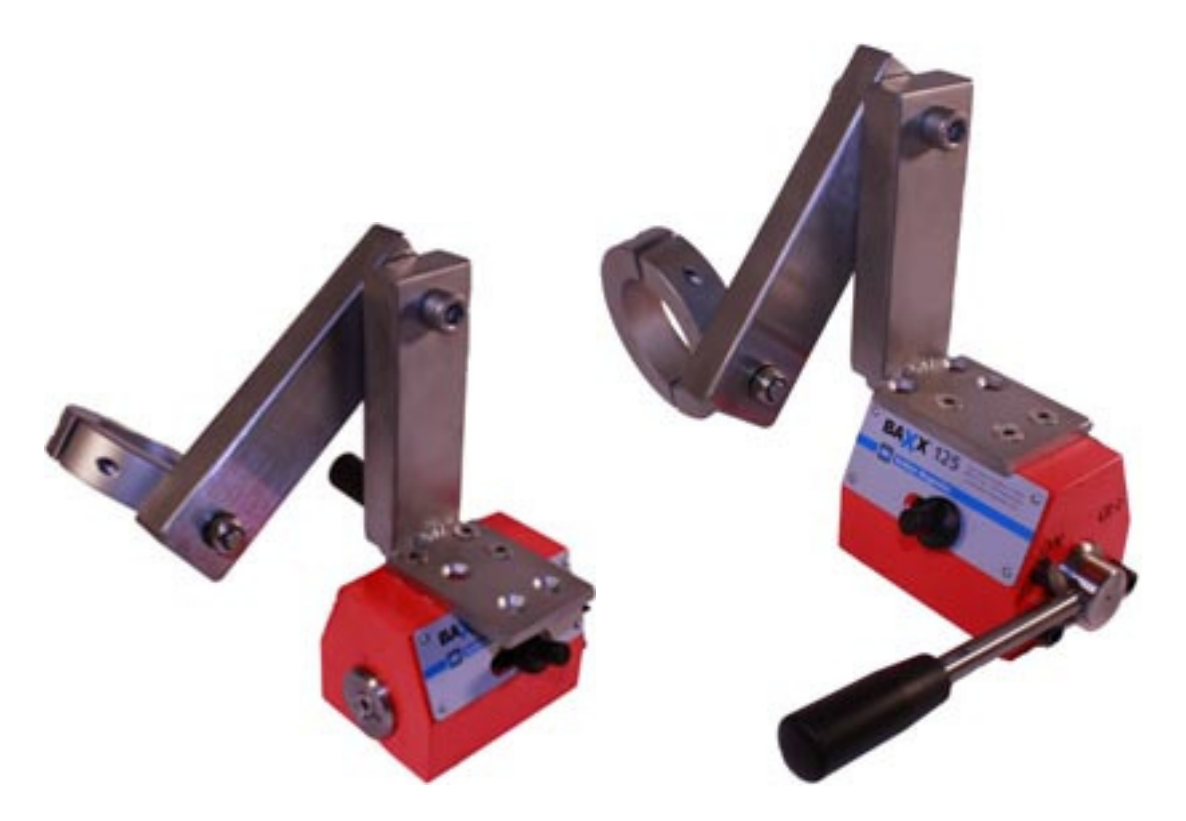
The magnet can be attached both ways to the Arm with 3 screws.